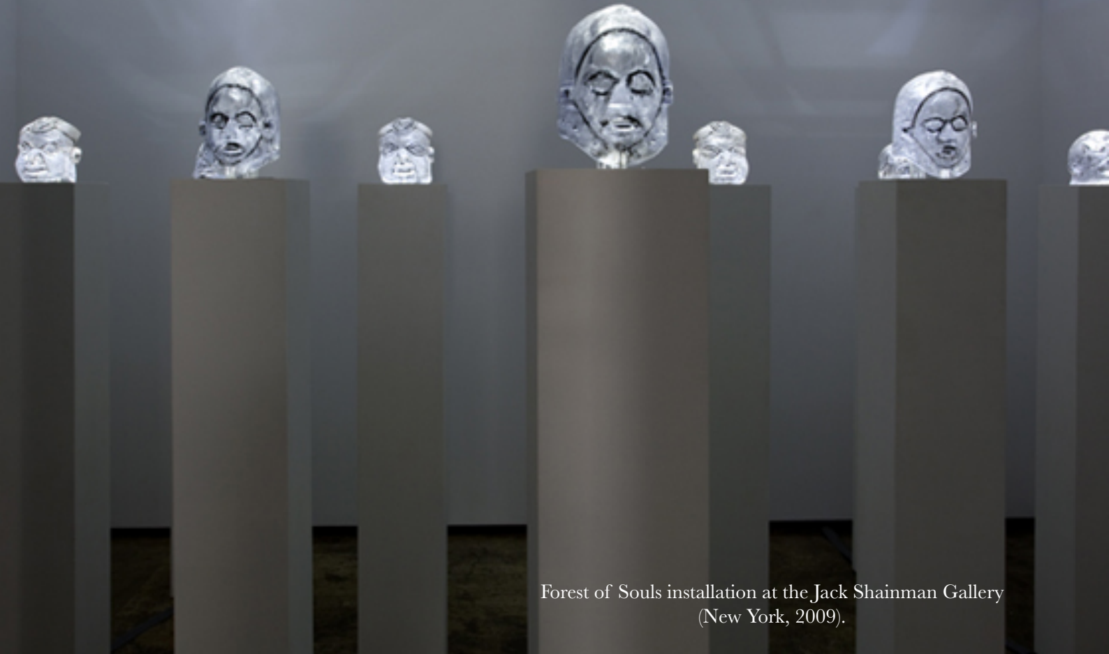
Forest of Souls installation at the Jack Shainman Gallery (New York, 2009).