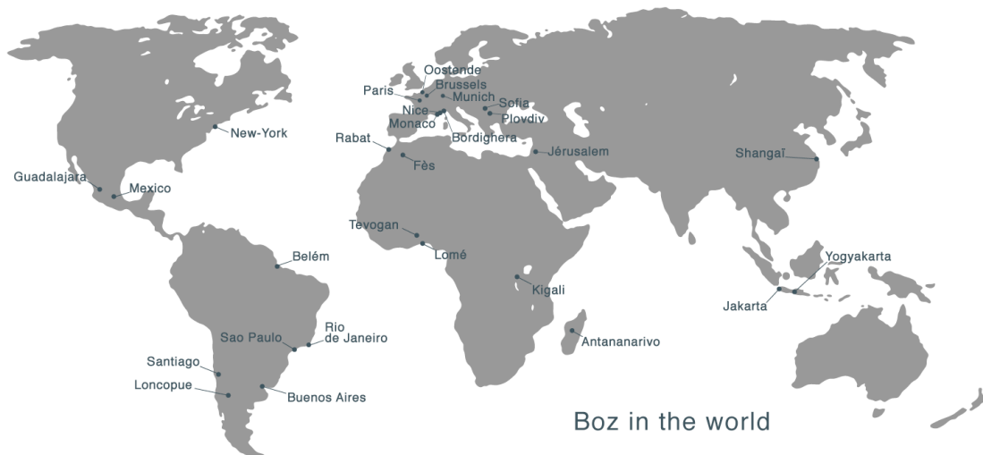
Boz in the world